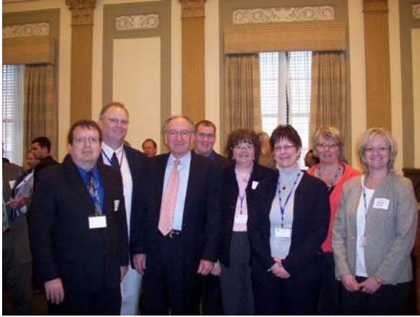
Iowa Group with Senator Harkin