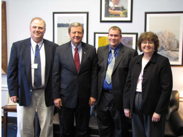
Iowa with Congressman Latham