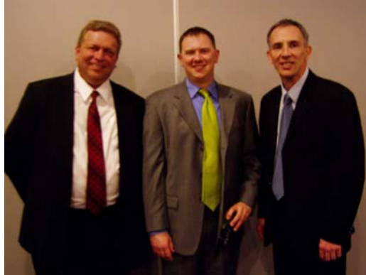
Ohio at Legislative Reception