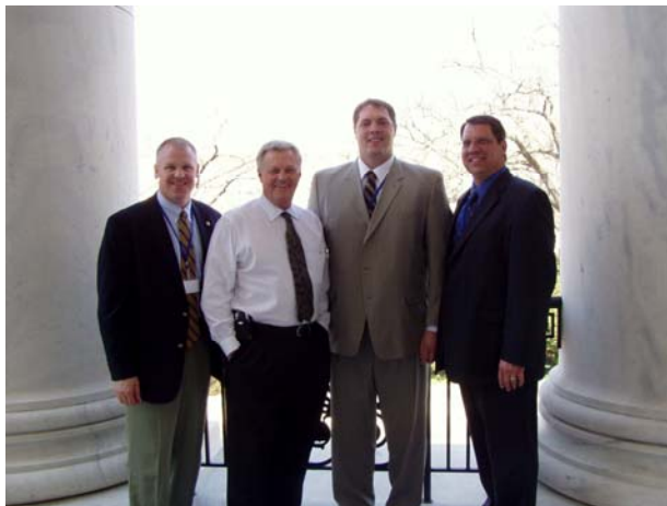
Minnesota Group with Congressman Peterson