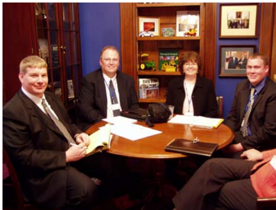
Iowa group with Congressman King's Ag Aide