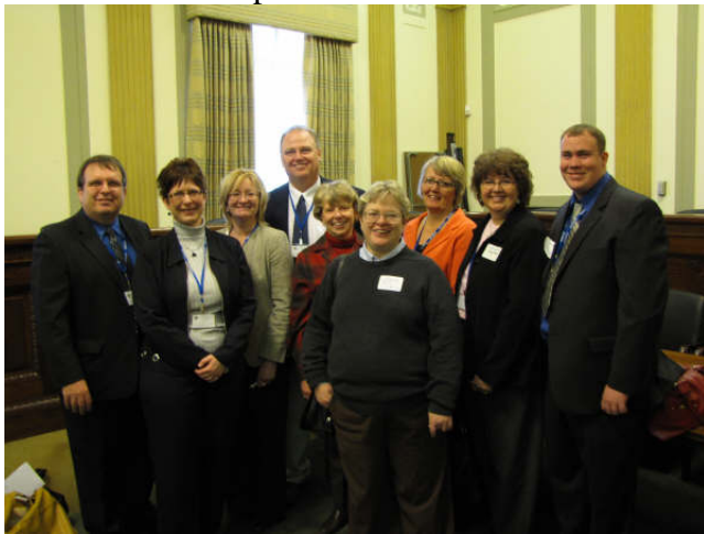
Iowa Group with Harkin Staff