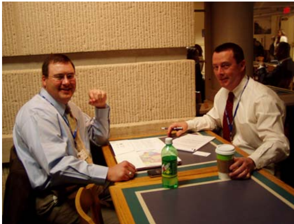
Preparing for visits!